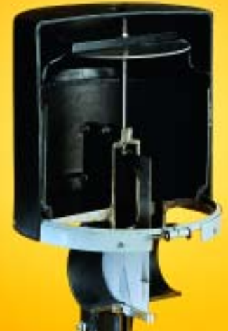
Flood-Gate® shown in closed position

The Flood-Gate® Automatic Backwater Valve, Fig. No. 7140, from Jay R. Smith Mfg. Co. provided positive shut-off time after time.